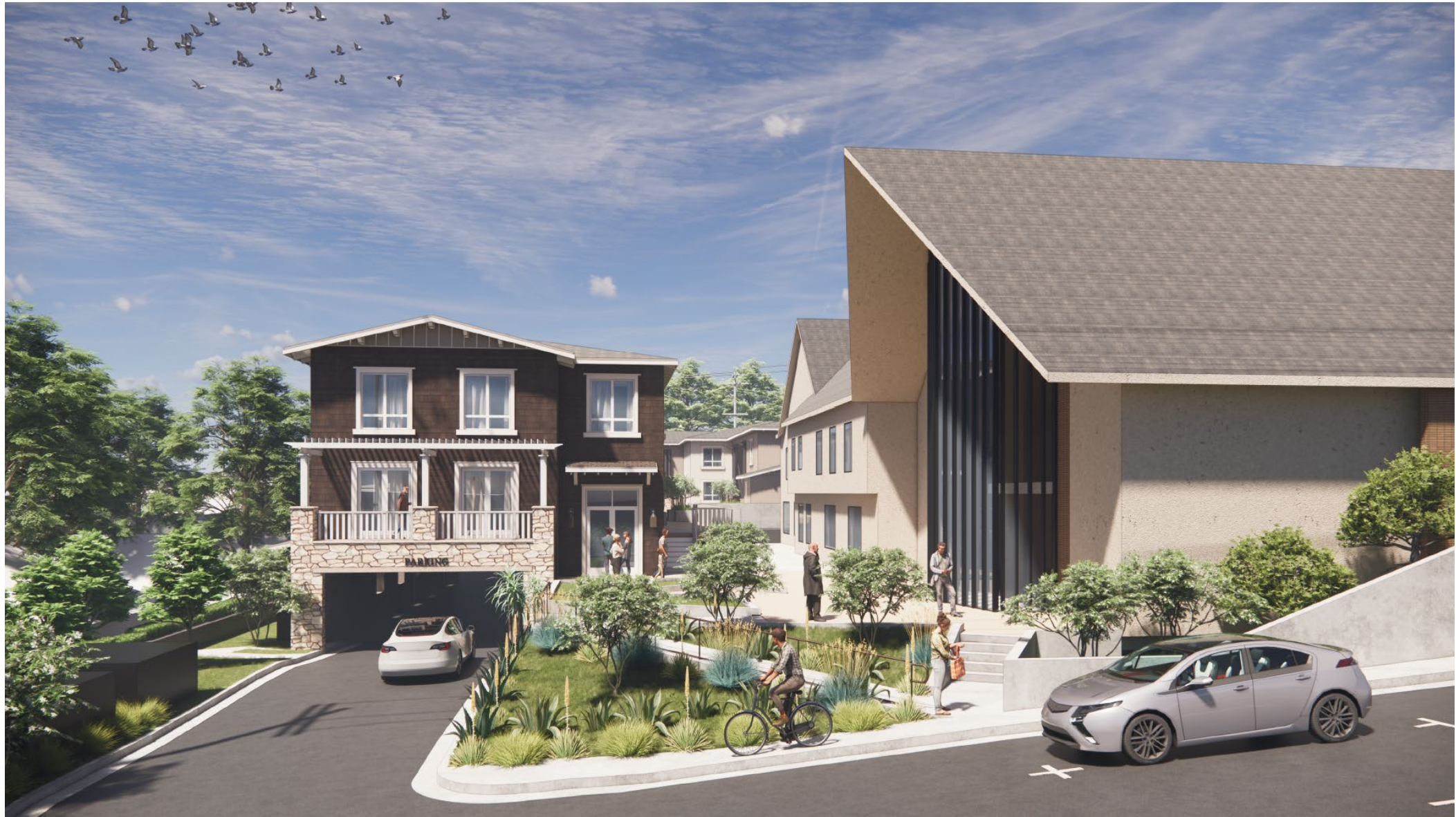
View from Glenneyre Street