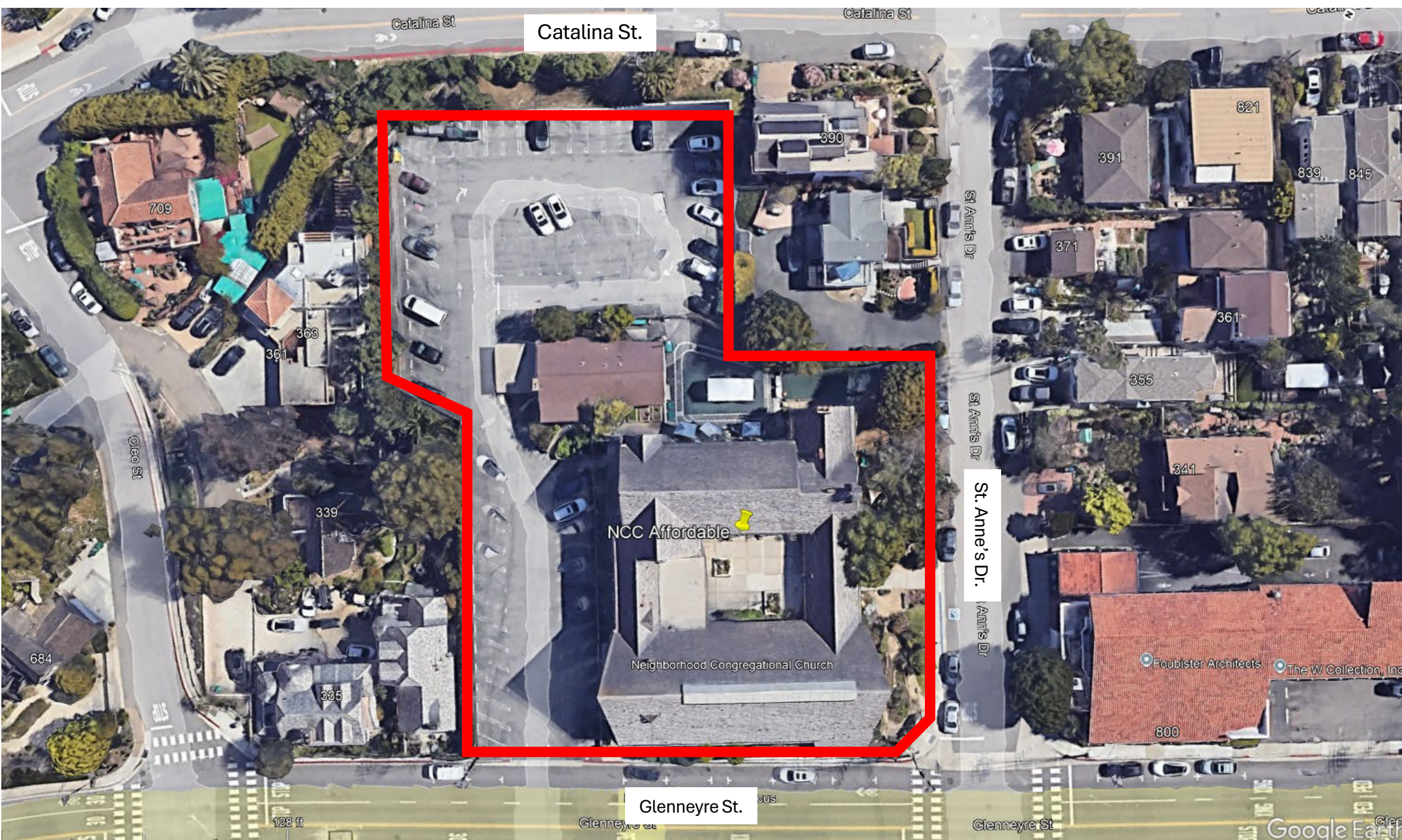
Neighborhood Congregational Church, Laguna Beach