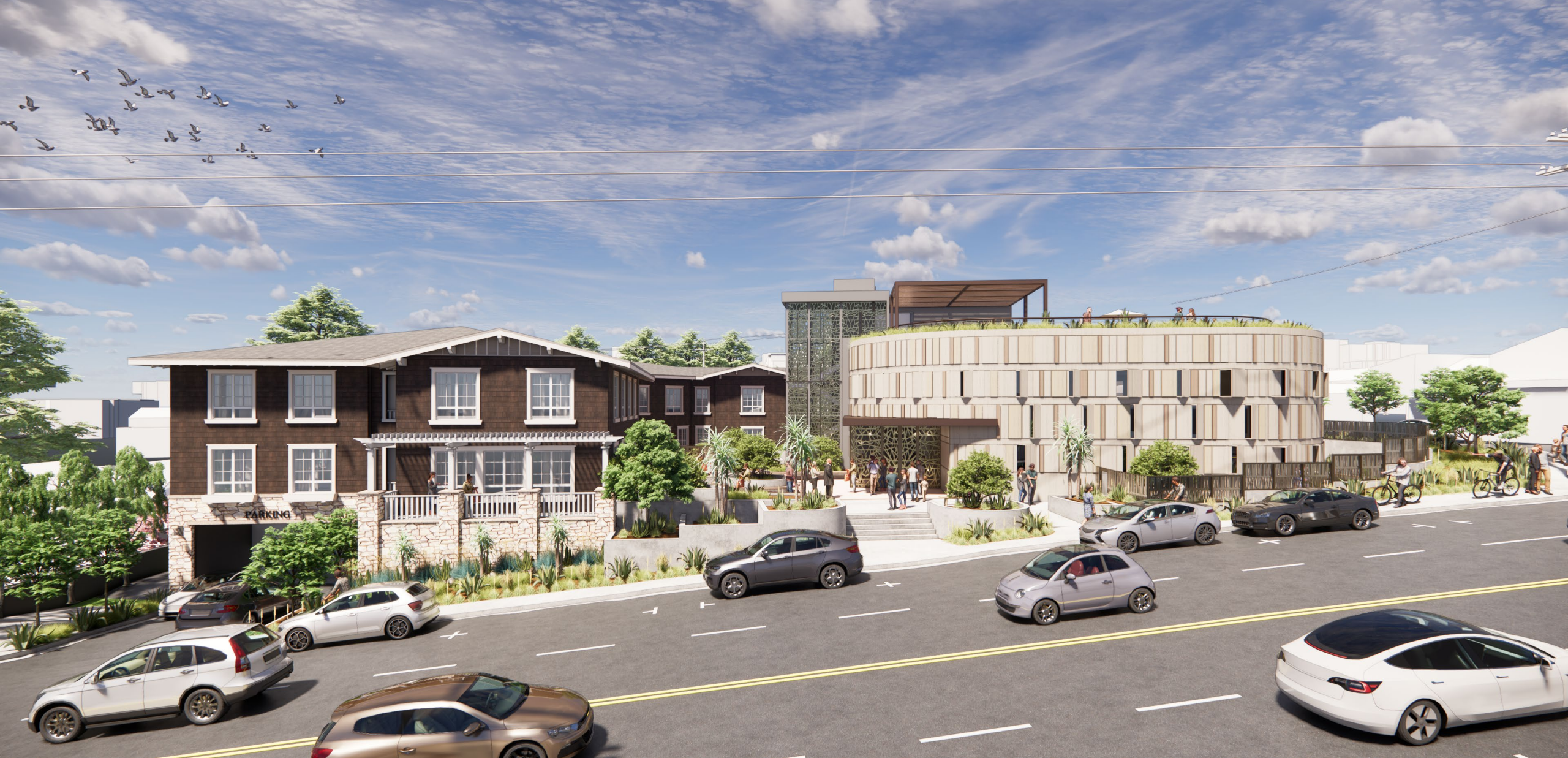
View from Glenneyre Street

Neighborhood Congregational Church, Laguna Beach